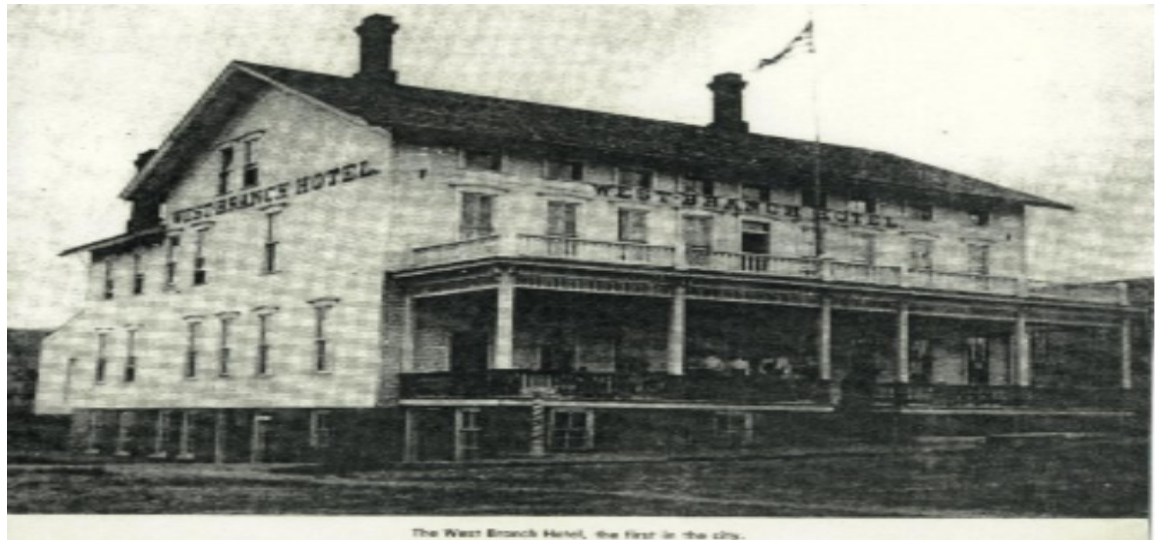
The West Branch Hotel, the first in the city.